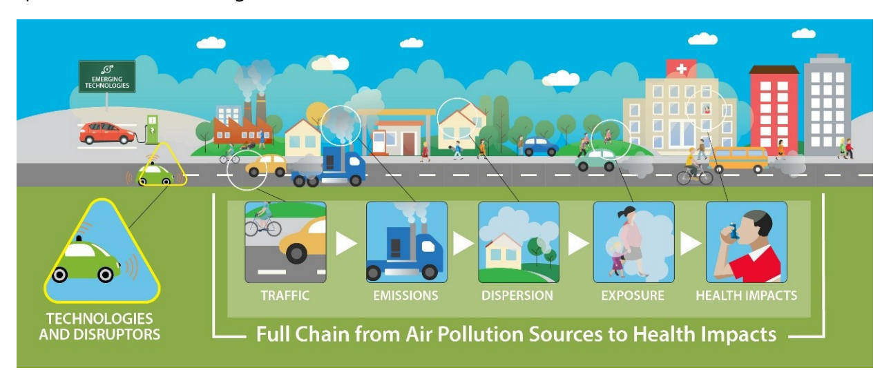
Figure 1. Tailpipe to Lungs Spectrum.

CARTEEH brings together experts from transportation and public health, two disciplines that have not traditionally worked together. CARTEEH's focus is to advance research on transportation emissions in a comprehensive manner, mapping the holistic tailpipe-to-lungs spectrum, as shown in Figure 1.