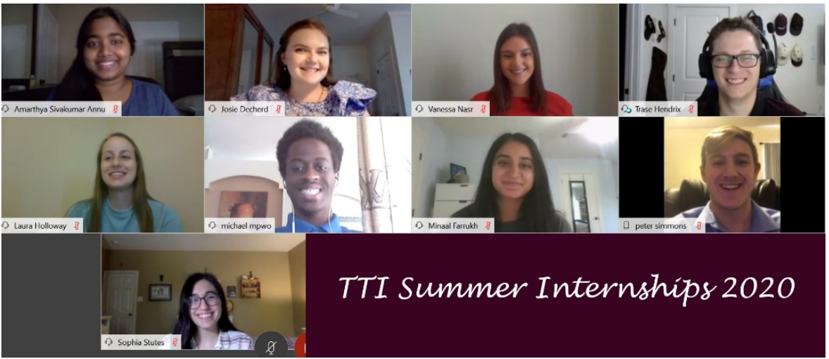
Figure 3. TTI Summer Intership Final Presentation.