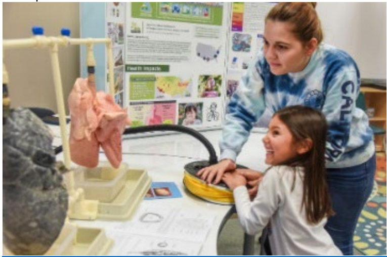
Figure 1. STEM night showing elementary and middle school children about the effects of air quality.

CARTEEH K-12 classroom lessons were developed to implement in 5th – 8th grade classrooms as a week-long scientific inquiry unit with the objective of measuring particulate matter and identifying sources of air pollution. A link to the lesson materials including teacher's guide, student handouts, and an overview video were distributed to 537 elementary and middle school teachers. From these schools, eleven elementary and middle schools, primarily Title I sites, were selected to receive a supply grant for air quality monitors. Teachers were also requested to complete survey on air pollution knowledge and beliefs, related environmental behaviors, and teaching practices. This data will inform further curriculum development efforts.