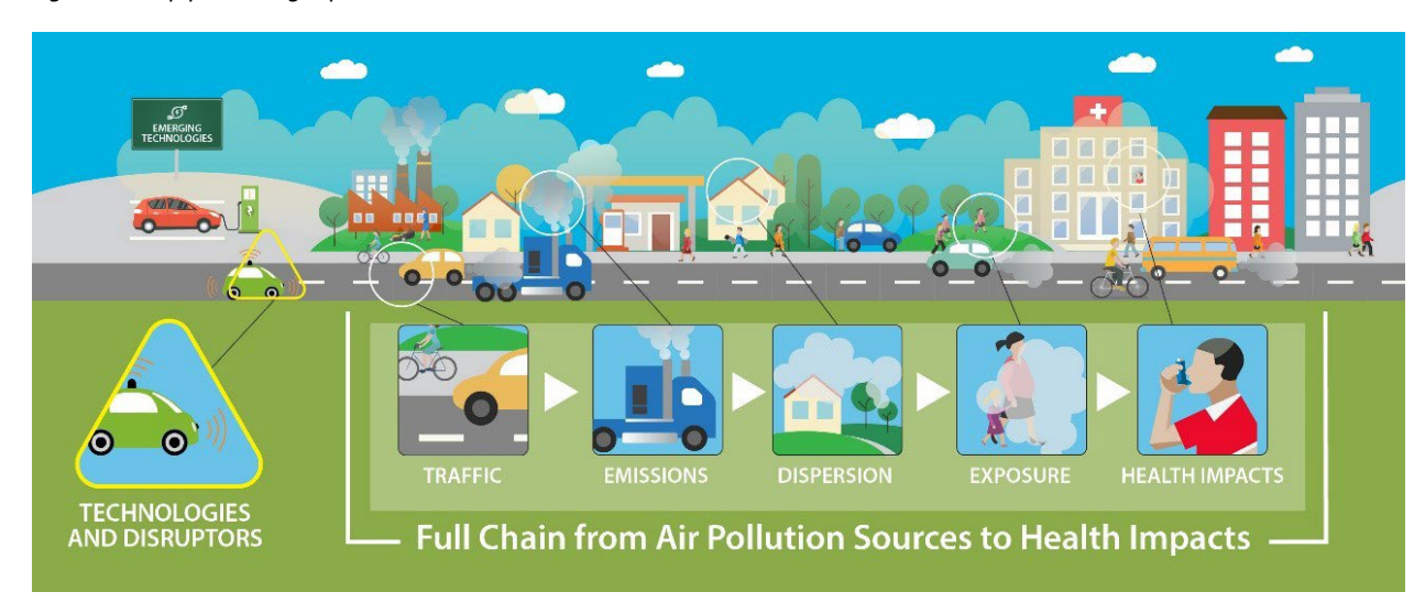
Figure 1: Tailpipe to Lungs Spectrum

CARTEEH brings together experts from transportation and public health, two disciplines that have not traditionally worked together. CARTEEH's focus is to advance research on transportation emissions in a comprehensive manner, mapping the holistic tailpipe-to-lungs spectrum, as shown in Figure 1.